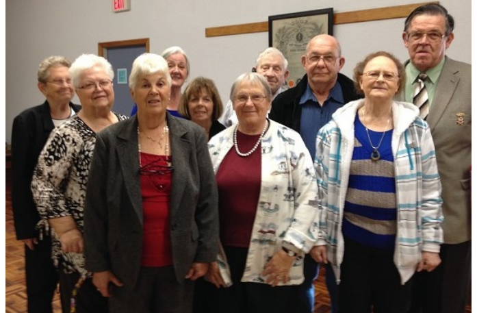
Members of Coquille Odd Fellow Lodge No. 53 initiated five new members for Bandon Odd Fellow Lodge No. 133. See "New Members at Bandon" left column.