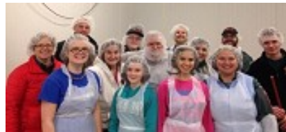
Crew 240 at the end of their shift at The Oregon Food Bank

The following week, Crew 240 headed off to the Oregon Food Bank to repackage bulk vegetables into smaller more manageable bags. We joined forces with 30 other volunteers from the Washington County area. In less than two hours the collective forces were able to reprocess 5,000 + lbs. of snap peas and get them stacked on a pallet for distribution statewide.