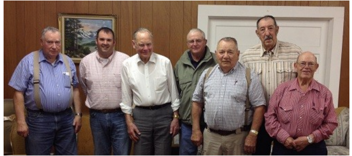
Lexington No. 168 Odd Fellows