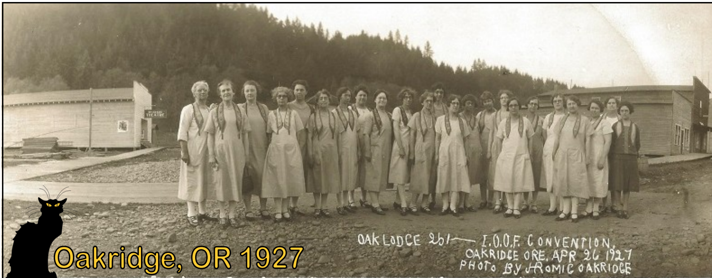
Oakridge, OR 1927