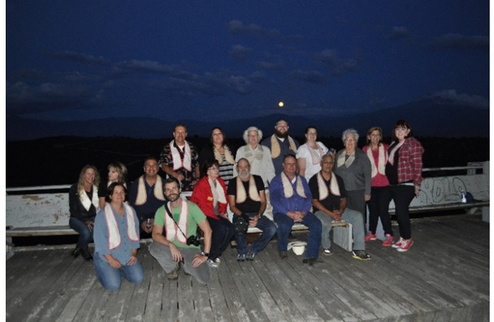
Pictured above: members from California and Oregon awaiting the conferring of the Second Degree