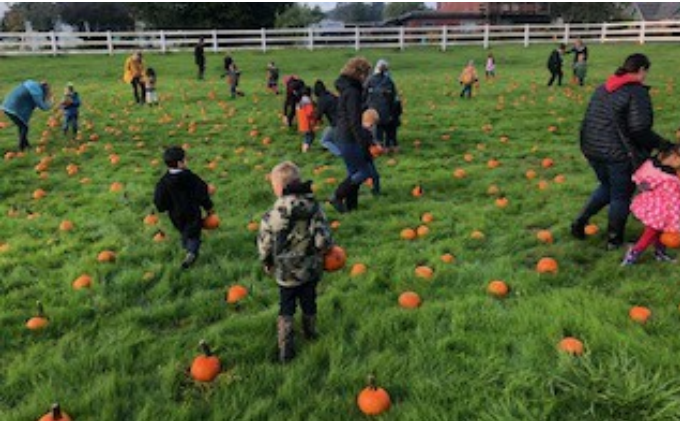
Tillamook Lodge hosted over 850 kids at their 12th annual pumpkin patch