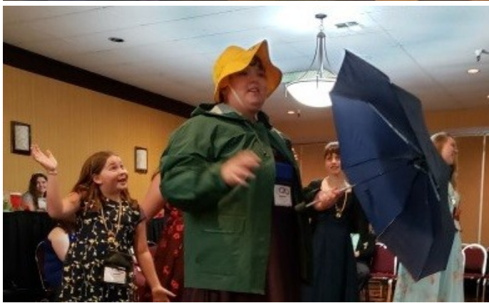
Below: The members of Eta Theta Rho enjoy a stop at Bonneville Fish Hatchery on their way to Yakima.