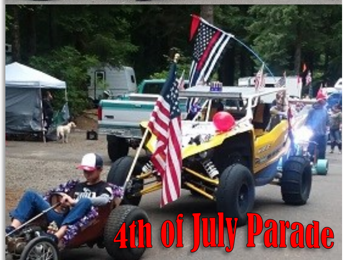
4th of July Parade