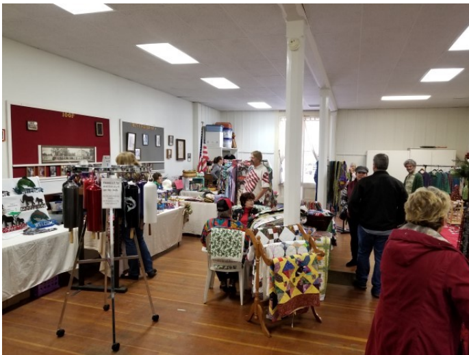
We had 10 vendors show up for the bazaar from a bell maker to a candle maker.

Learn from yesterday, live for today, hope for tomorrow. – Albert Einstein,