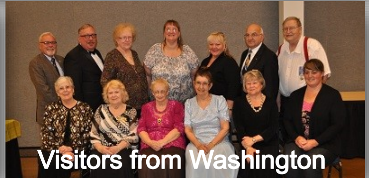
Visitors from Washington