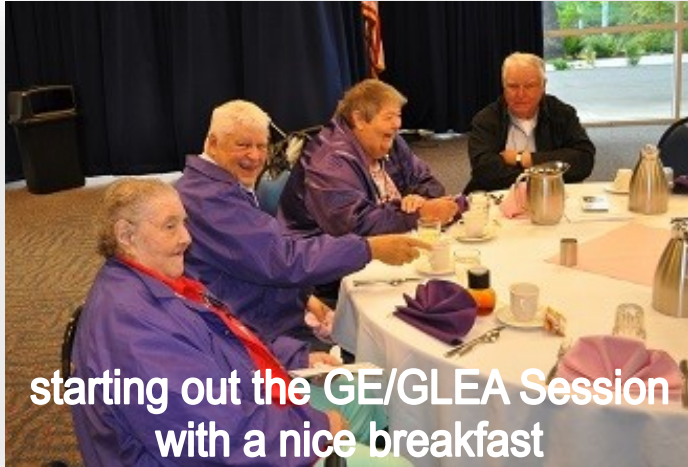
starting out the GE/GLEA Session with a nice breakfast