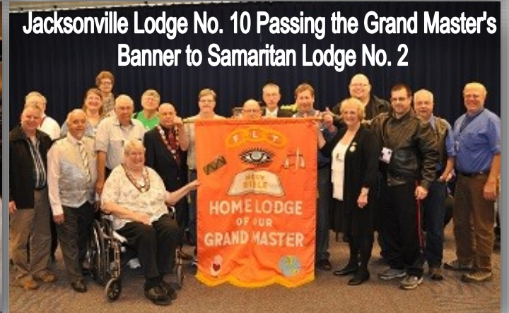
Jacksonville Lodge No. 10 Passing the Grand Master's Banner to Samaritan Lodge No. 2