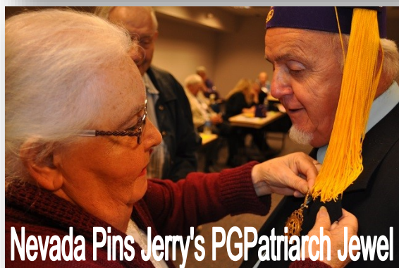
Nevada Pins Jerry's PGPatriarch Jewel