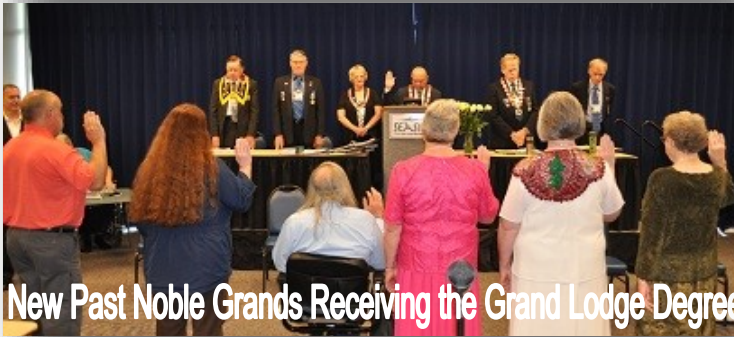
New Past Noble Grands Receiving the Grand Lodge Degree