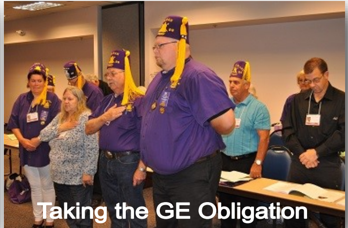
Taking the GE Obligation