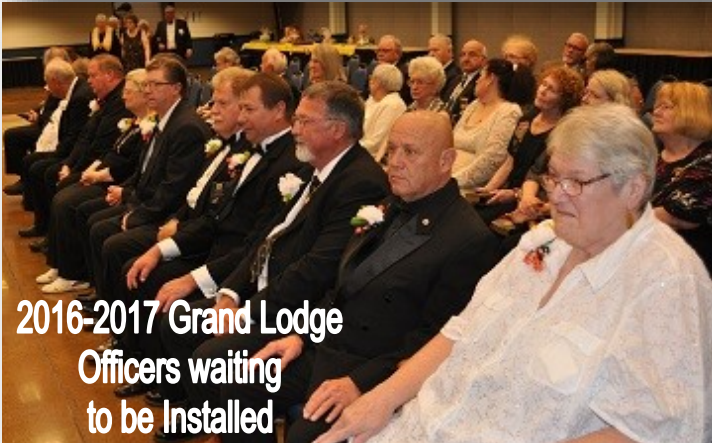
2016-2017 Grand Lodge Officers waiting to be Installed