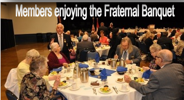
Members enjoying the Fraternal Banquet