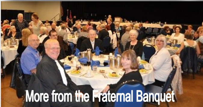
More from the Fraternal Banquet