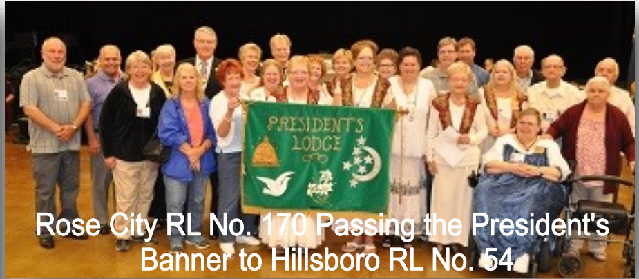
Rose City RL No. 170 Passing the President's Banner to Hillsboro RL No. 54