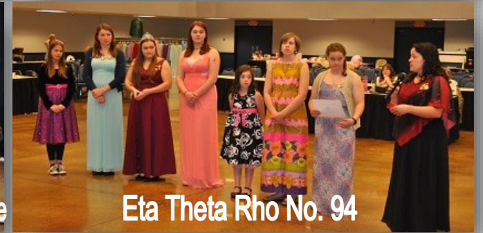
Eta Theta Rho No. 94