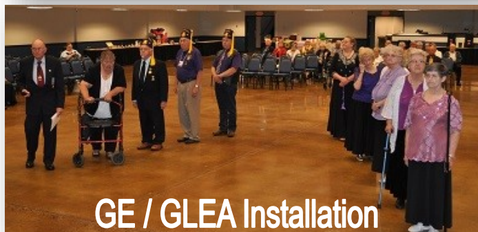
GE / GLEA Installation