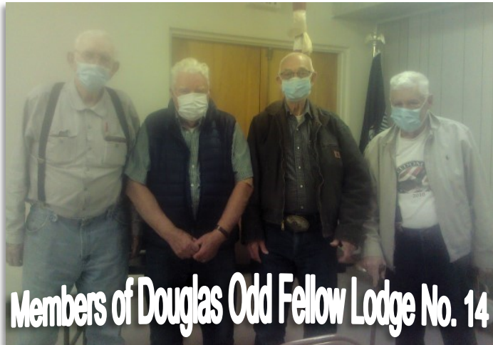
Members of Douglas Odd Fellow Lodge No. 14

We must reject the idea that every time a law is broken, society is guilty rather than the lawbreaker. It is time to restore the American precept that each individual is accountable for his actions. – Ronald Reagan