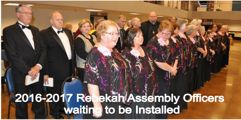
2016-2017 Rebekah Assembly Officers waiting to be Installed