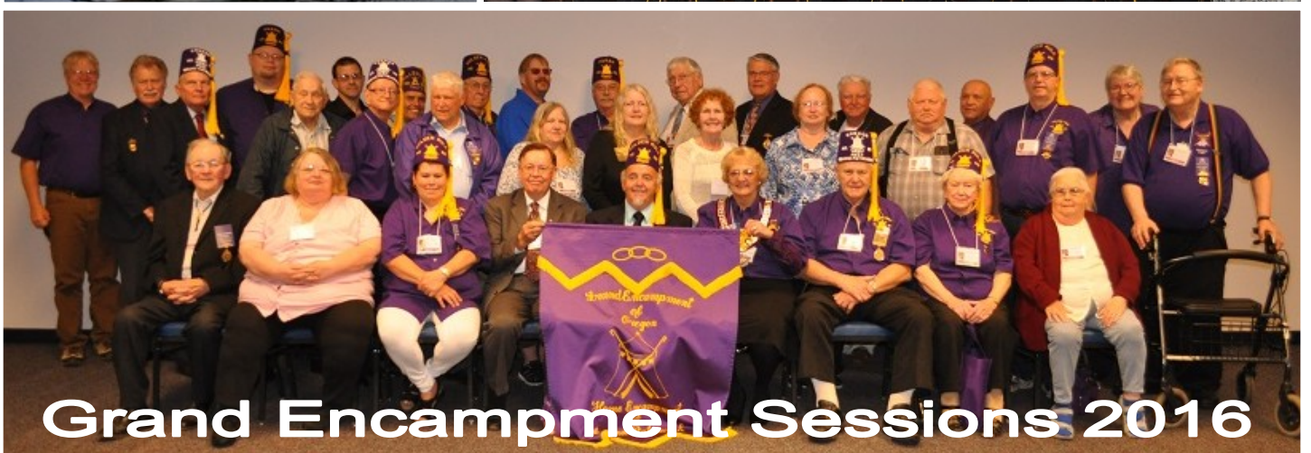
Grand Encampment Sessions 2016