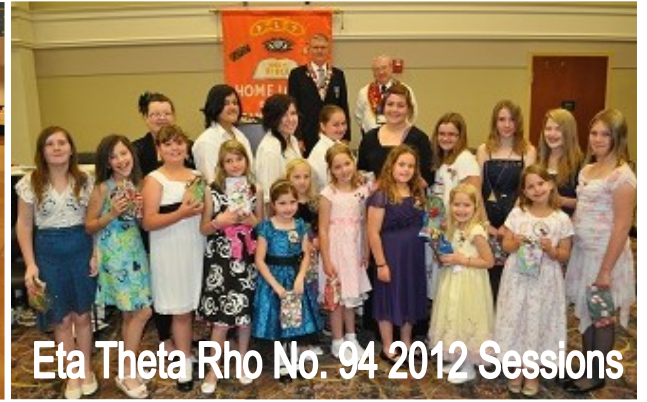
Eta Theta Rho No. 94 2012 Sessions