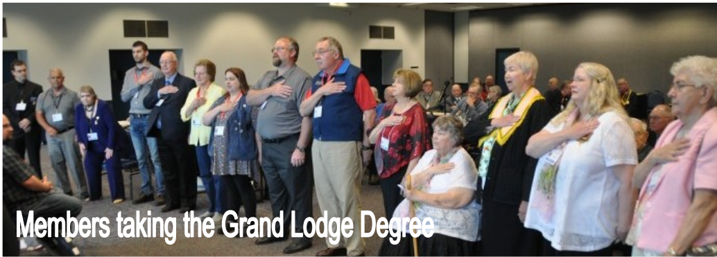
Members taking the Grand Lodge Degree