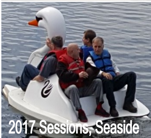
2017 Sessions, Seaside