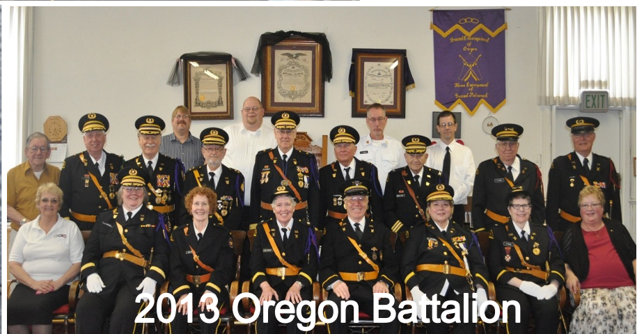
2013 Oregon Battalion