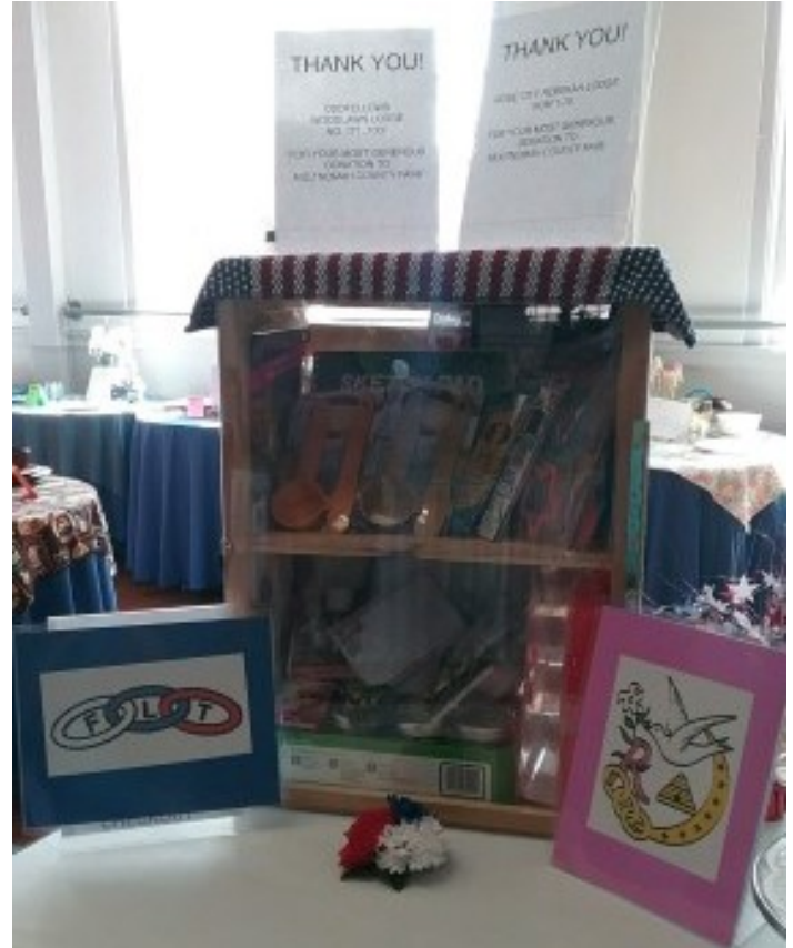
Rose City Rebekah Lodge No. 170 and Woodlawn Odd Fellow Lodge No. 171 had a display of items they donated to give to the youth who brought entries to the Multnomah County Fair in the foods and art departments.

Those who bring sunshine to the lives of others cannot keep it from themselves . ~ James Matthew Barrie