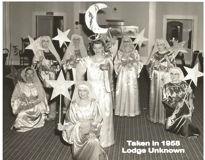
Taken in 1958 Lodge Unknown

Sept. 20...Prosperity No. 104..Klamath Falls..7:00 pm